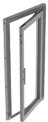
Big vision panel