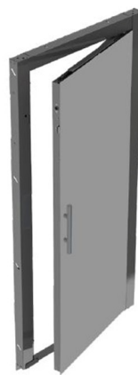
Sheet metal panel